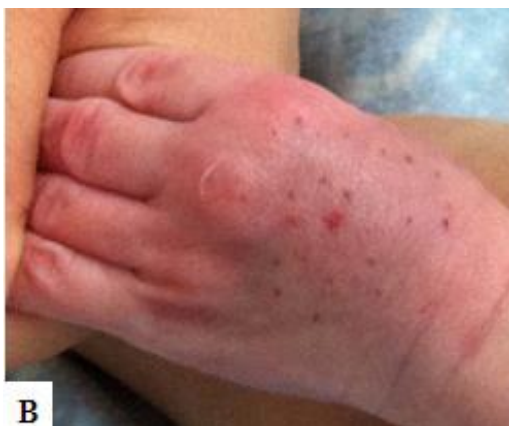
Fig. 2: Use of hyaluronidase together with hirudoid decreased the severity of extravasation injuries. (A) Skin swelling and erythema a few hours after total parental nutrition fluid extravasation in a newborn aged 11 days. (B) Appearance 2 days after early treatment (<8 h). (C) Skin swelling and erythema completely disappeared in the 8th day after treatment, necrosis has been avoided.

injecting hyaluronidase is 8 hours, and 3 hours for high risk medications, such as dopamine and epinephrine. But if exceed the golden time and the extravasation has done damage to the patient or developed to grade 3 or grade 4, hyaluronidase is still injected to prevent further damage, and has been effective. However, if the extravasation has