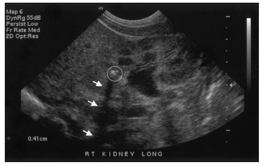
Figure 3. Ultrasonographic appearance of renal calculi. Many renal calculi do not appear as prominently as the one circled, but they still can be identified by the hypoechoic "shadow" they produce, as shown by the arrows.

the risk of urinary stones; other citrus juices have not been implicated. Because potassium depletion increases calciuria, patients should receive adequate dietary potassium, particularly if they are taking diuretics.