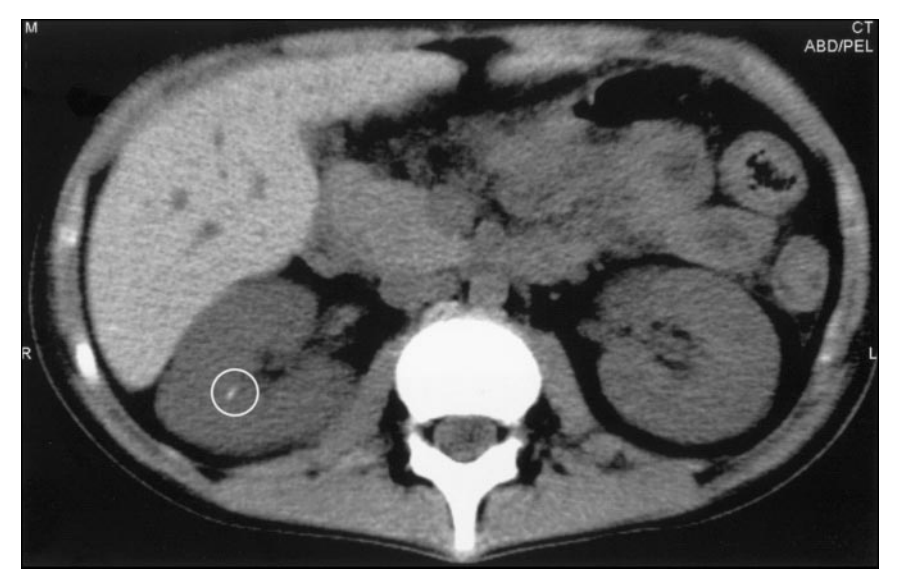
Figure 4. Renal calculus on unenhanced computed tomography (CT). With judicious use, noncontrast helical CT may be helpful in identifying renal calculi (such as the one circled) as well as nonrenal causes of abdominal symptoms.

duction. For patients who have very high production of uric acid, allopurinol increases urinary xanthine, which may precipitate into secondary xanthine stones. Dietary purine restriction is of limited value; most children do not consume significant quantities of purine-rich foods, such as anchovies, mussels, goose, brain, kidney, and liver. Counseling patients to avoid unusual amounts of purine intake is appropriate.