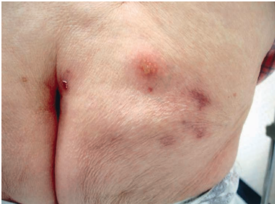
Figure 7. Zosteriform herpes simplex in an elderly woman who presented with what she called “her recurrent shingles.” Vesicles in a lumbosacral distribution had recurred many times over the past several years, and this outbreak began 1 week before the photo was taken. A viral culture demonstrated herpes simplex virus type 2. The patient was otherwise healthy, except for hypertension.

of a similar rash in the same distribution (to rule out recurrent zosteriform herpes simplex; see figure 7); and (6) pain and allodynia in the area of the rash. Allodynia, which is common in both HZ and PHN, is pain evoked by a stimulus that does not normally cause pain—for example, light brushing of the affected area with a cotton swab.