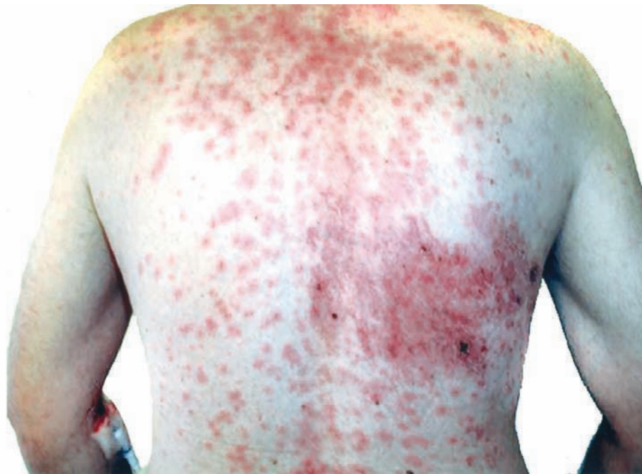
Figure 6. Disseminated herpes zoster

agnoses, and incomplete information about comorbid disease [32–34].