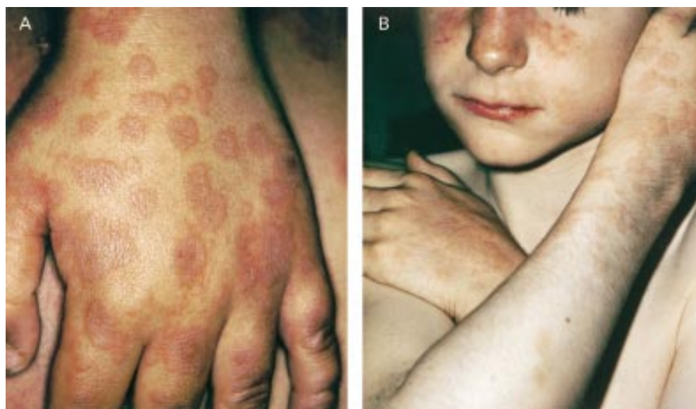
Figure 1 (A) Typical targets of EM associated with raised oedematous papules on hand. (B) Typical targets of EM acrally distributed in a child with labial herpes.

herpes score of Assier and colleagues. 17 This score (0–4) was established by adding the following criteria (one point each): recurrent EM, history of recurrent herpes, recent clinical herpes (preceding EM within three weeks), and a demonstration of a recent herpes simplex virus infection (virus isolation, positive immunofluorescence, or seroconversion). EM was firmly attributed to herpes simplex virus infection for a score of 2 or more, without any other suspected aetiology. Herpes virus infection was only suspected for a score of 1.