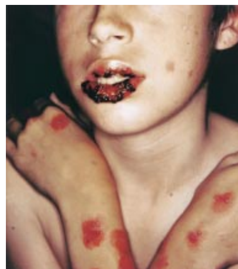
Figure 6 Atypical EM showing blisters on purpuric macules acraly distributed in a child with labial herpes.