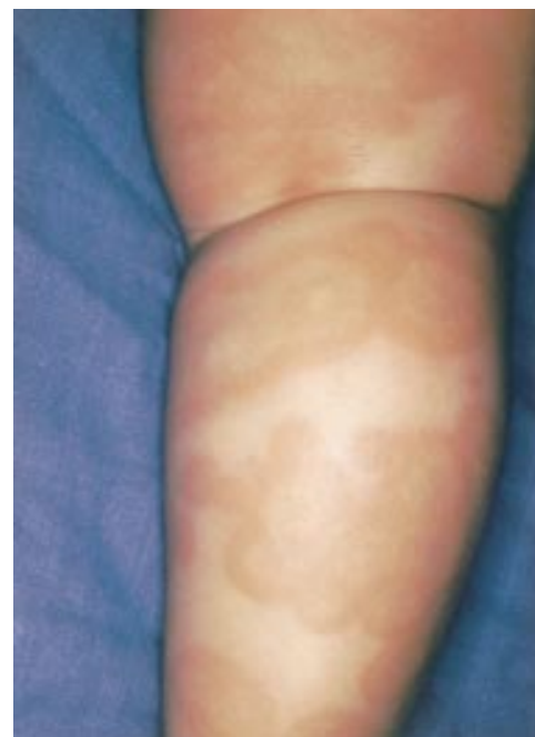
Figure 3 Example of most frequent EM misdiagnosis, acute urticaria with haemorrhagic cockade pattern.

Three patients received thalidomide for either acute illness (one case of SJS) or severe recurrent disease (one case of EM major and one case of SJS). While the patient with recurrent EM major was well controlled by thalidomide (case 22), the one with recurrent SJS, a 12 year old boy (case 37) had a severe recurrent disease of unknown aetiology (eight relapses in four years) with primary severe mucous membrane involvement and digestive bleeding as a result of oesophageal involvement confirmed by endoscopy. Relapses were initially controlled by thalidomide taken in the first hours of the disease, but then a severe relapse with skin